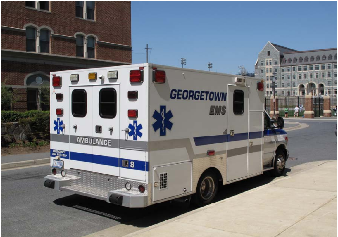
Georgetown Emergency Response Medial Services (GERMS) ambulance